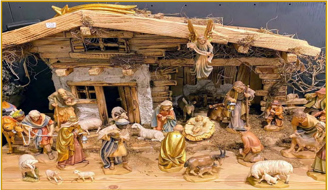
The nativity scene or crèche, called in Italian the presepe or presepio, brings to life the story of the Nativity