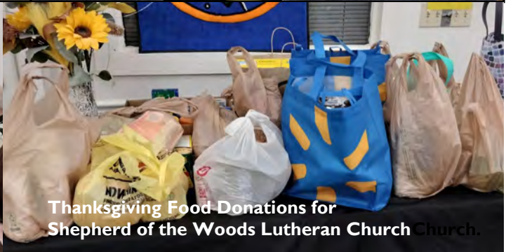
Thanksgiving Food Donations for Shepherd of the Woods Lutheran Church Church.