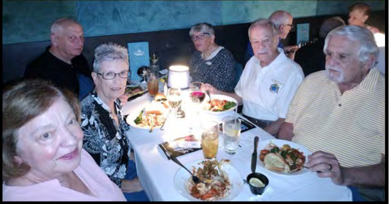
On Saturday March 29, members from OSDIA, IAC, Family & Friends a total of 72, enjoyed the performance of the West Side Story.