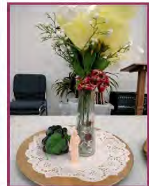
Decorations on the Tables