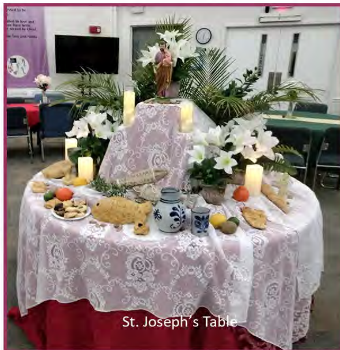
St. Joseph’s Table